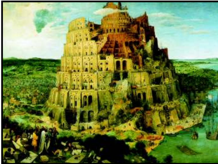
The Tower of Babel -- An Ancient Attempt to Centralize Power and Authority.

We saw in Lesson 15 that many of the Judeans criticized the Messiah because he taught the people without having received formal training by the “so-called” Judean educational experts -- the “teachers of the law.” He did not have proper credentials (degrees, diplomas, certificates, licenses, etc.) issued by the recognized Judean authorities. Thus, they considered him to be an “unlearned” man ( John 7:15 ). They also questioned his “authority.”