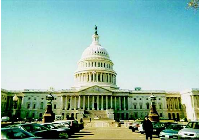
The U.S. Capital Building -- A Modern Example of Man's Attempt to Centralize Power and Authority.